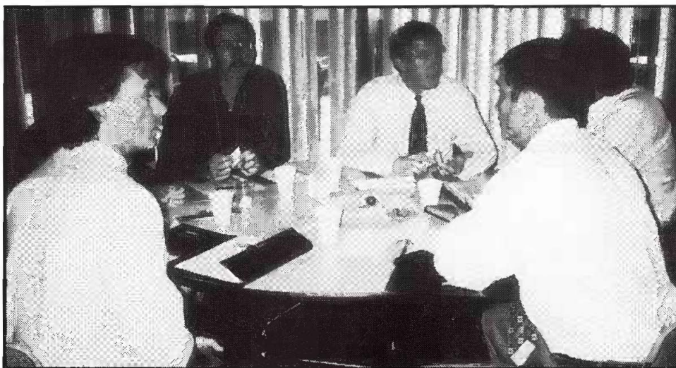
Let's assess the donuts.