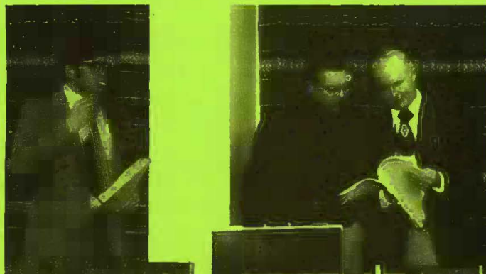
Were you there last year -- or the year before?