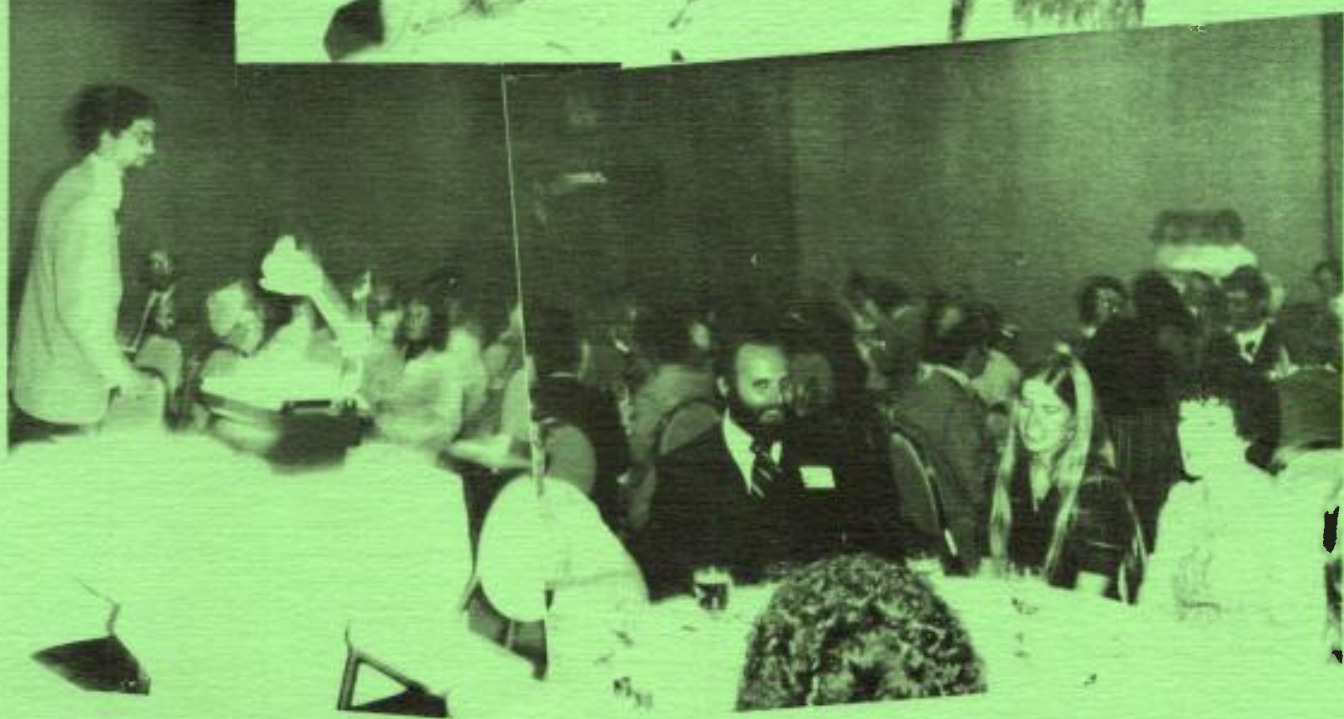
Scenes from the 18th Annual Conference October 13 and 14, 1978